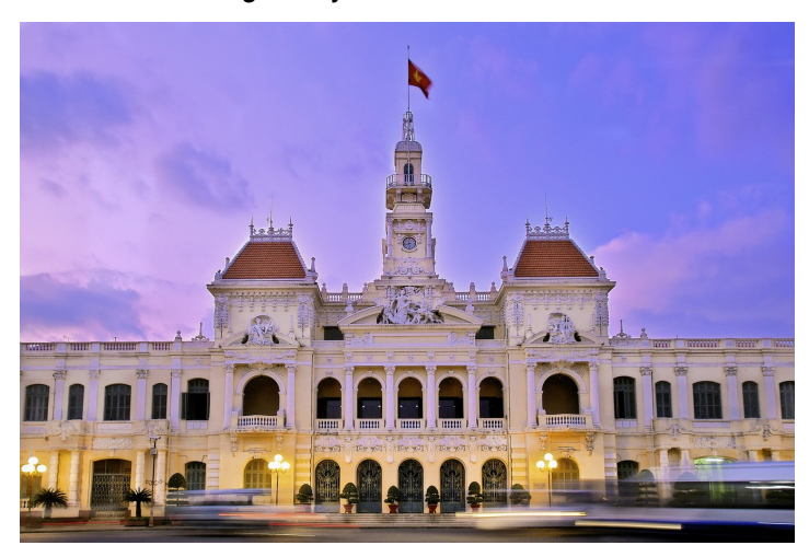
Day 12: Ho Chi Minh - Mekong Delta - Can Tho (B, L) Today we will start our exploration of the Mekong Delta, a major rice producing area. This must be one of the most fascinating riverine deltas in the world. After breakfast, drive to Cai Be in the heart of the Mekong Delta.

Optional tour – Ho Chi Minh Vespa Tour: Experience as local people with a Vespa and escorted by a driver, visiting the city landmarks that give you a view of the city unlike anything on your Vietnam tour. Take a peek at the history, the streets and the sights that most visitors never even hear about or see. You will pass through the Chinese district of Saigon, stop to see a sweet smelling flower market and visit a breathtaking yet hidden Buddhist pagoda, Saigon Opera House & Post Office which were designed by Gustave Eiffel.