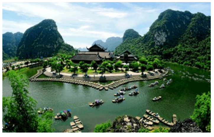
Day 6: Halong - Hoian (B/L)

Note: Visits or activities will be slightly different depending on each junk's itinerary. Your tour guide will be replaced by a local guide on board during your cruise.